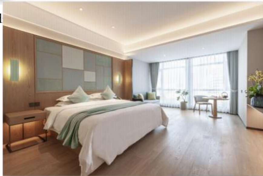
Four Seasons Concept Master Bed