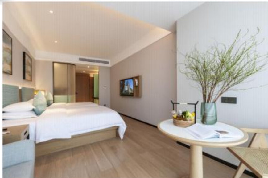
Four Seasons City King Room Four Seasons City Twin Room