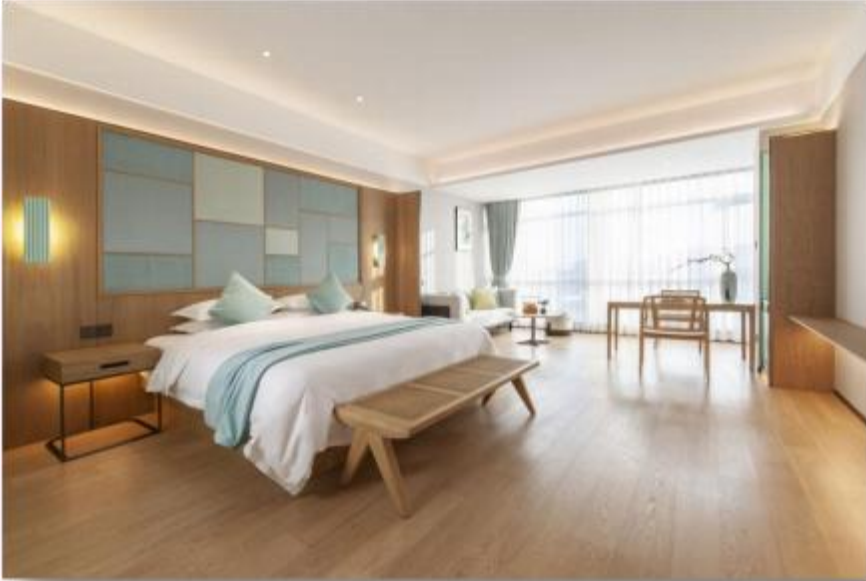
Executive Business King Room